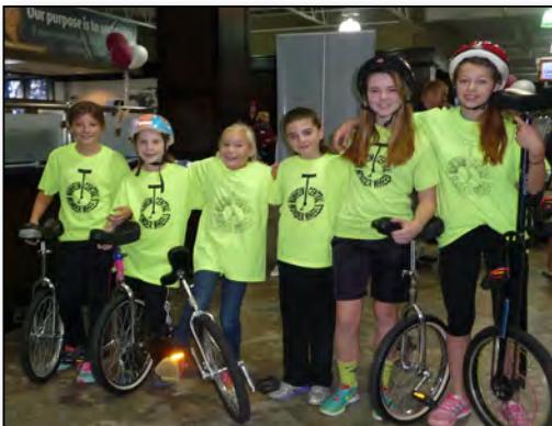
Last year's Talent Showcase included an appearance by the Doe Run Wonderwheels

Back by popular demand! A Talent Showcase, featuring MCMS students, will take place in the lobby during the breakfast fundraiser. Come on out and support our local talent while donating to a great cause.